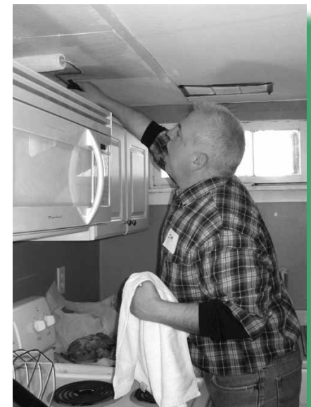
Picture Perfect: A volunteer paints life back into our School to Work office.

To learn more about our volunteer opportunities please contact Pat Simons at 781-942-4888 Ext. 4032 or volunteers@theemarc.org .