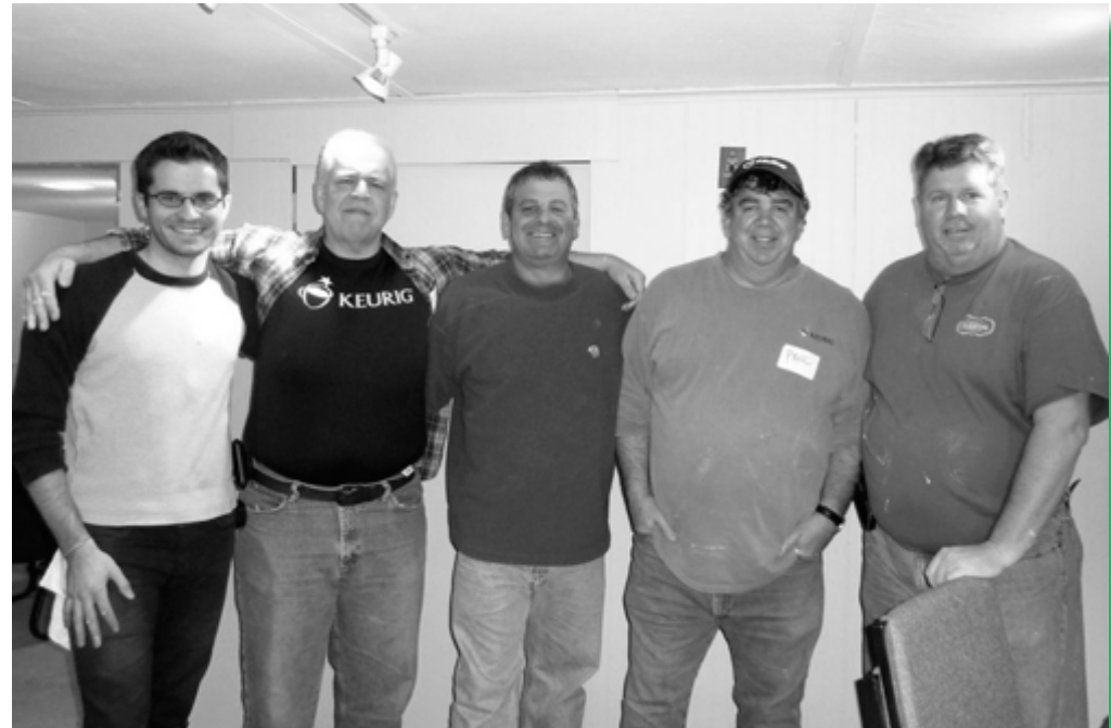
Shining Stars! Keurig staff spruced up the School to Work's office with a fresh coat of paint and new lighting.

To help celebrate National Volunteer Week EMARC will be hosting our second annual Volunteer Appreciation Breakfast on Saturday, April 9. This year over two hundred volunteers have volunteered over 1300 hours to EMARC and the people that we support.