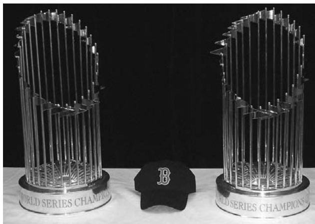
Red Sox Nation – Deepest thanks to the Boston Red Sox for adding a special touch to our annual gala by lending us the World Series Trophies for the evening!

Many thanks to those of you who participated in our Service Exchange pilot project. The project was designed as a possible way to keep participation in the Journey to Independence program affordable. We thank the Doug Flutie Jr. Foundation for Autism for funding this pilot. Unfortunately, the economic climate and low number of participants have prevented continuation of the Service Exchange project. We pledge to continue to explore creative ways to keep our programs accessible to all.