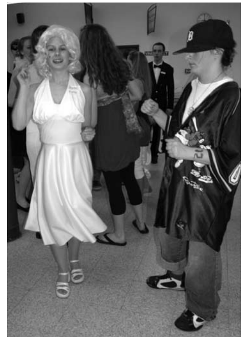
The Arc's Hollywood dance.

Dues: $40 per year. Please make check payable to The Arc of East Middlesex.