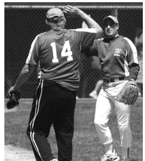
High Five - The EMARC Eagles Softball team brought home the gold again this summer.

Dues: $40 per year. Please make check payable to The Arc of East Middlesex.