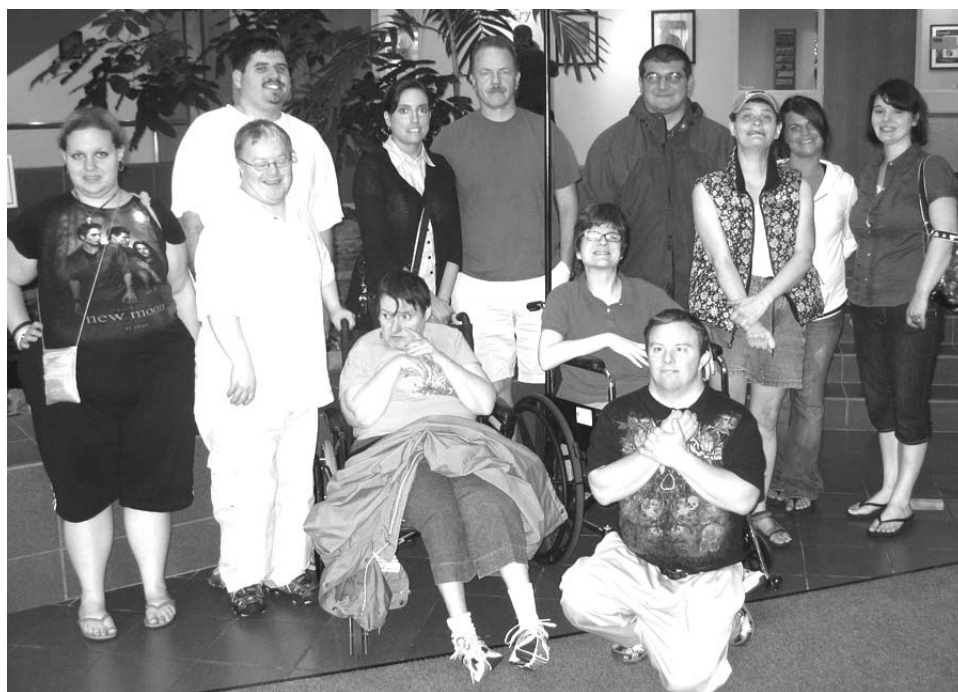
Fine Art Track - Participants and Staff of the Art Program pose while attending their exhibit at the Musculoskeletal Center in Peabody.

Christine ends with saying “ My motto with the group is the following: Don’t use someones bad day to get in the way of your happy one. I always believe that if you are light hearted and laugh a lot good things happen”.