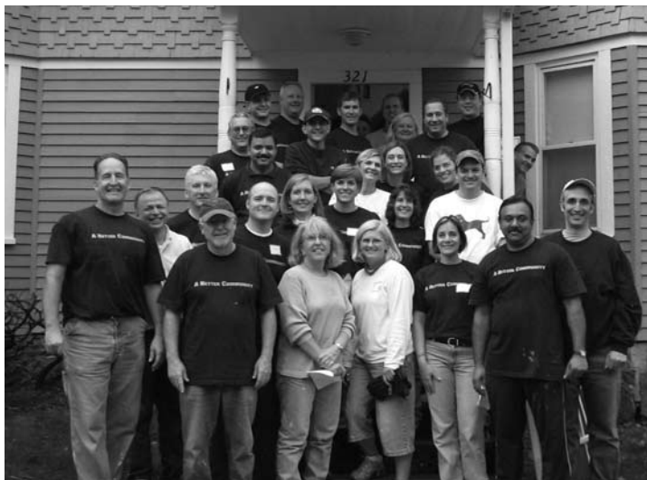
Boston Cares arranged for employees from SAP in Burlington to spend a day this fall sprucing up our Haven Street residence.

For other volunteer opportunities with The Arc of East Middlesex, please call Pat Simons at 781-942-4888, ext. 4032.