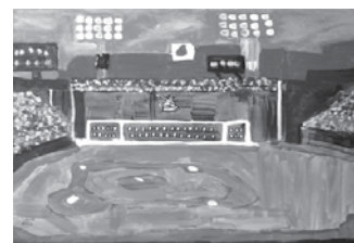
Fenway Park by Beth Knipstein

T he Arc of East Middlesex's Center for Emerging Artists now has Fenway Park inspired items on sale at: The Hitching Post, The Hot Spot and Sense of Wonder in Reading; Green Street Pharmacy in Melrose; Kelly and the Angel in Malden and General Goods in Andover. Fenway prints, note cards, key chains and t-shirts are available online at www.theemarc.org and at our 20 Gould Street, Reading location. For on-line orders, please allow up to four weeks for delivery of t-shirts.